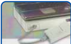
Rotary Rajkot Greater AUDIOMETRY LAB